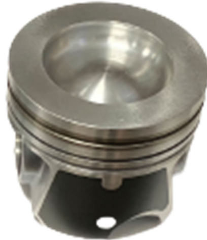
Heavy Duty Upgrade